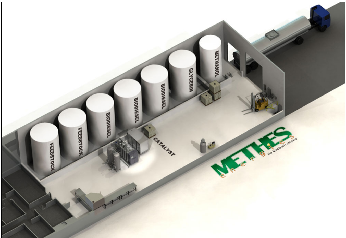
Typical 5 M Liter per year plant layout.

Methes Energies® is a registered trademark of Methes Energies Inc. All rights reserved.